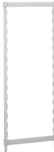
Post Kit includes two Posts and one set of Post Connectors.