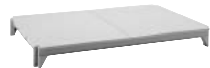
Solid Shelf Kit includes two Traverses and Solid Shelf Set for one shelf.