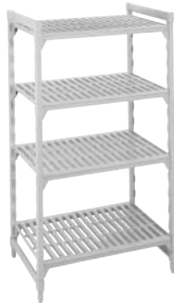
Four Shelf Unit with Vented Shelf Plates.