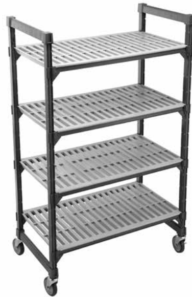
Mobile Four Shelf Unit with Vented Shelf Plates. (Built using 2 Mobile Post Kits and 4 Mobile Shelf Kits.)