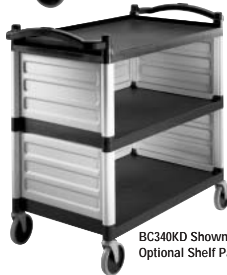
BC340KD Shown with Optional Shelf Panel Sets