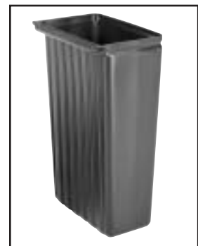
8 Gallon (30,3 L) Trash Container