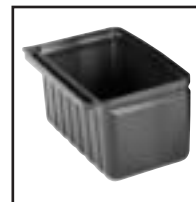
2.5 Gallon (9,5 L) Silverware Holder