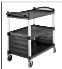
Shelf Panel Set (includes 1 Side Panel and 2 End Panels)