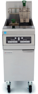
Shown with optional castors