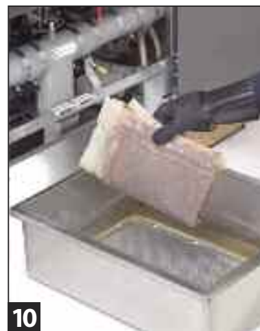
10 Remove and discard used filter paper.