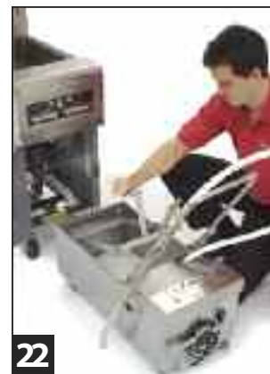
22 After filter parts have cooled to the touch, return the filter screen (making sure it is securely in place), hold-down ring, crumb tray, and lid to the filter pan.