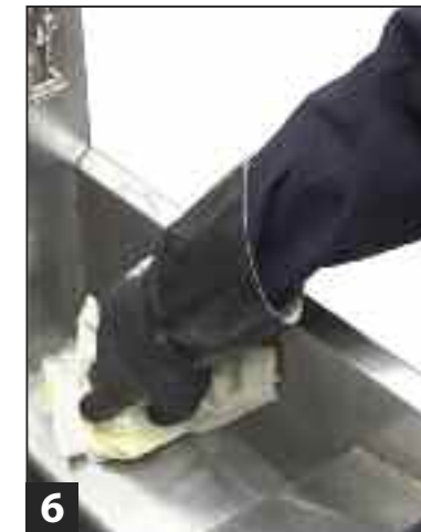
6 Turn off filter pump (yellow handle). Wipe out frypot with paper towels.