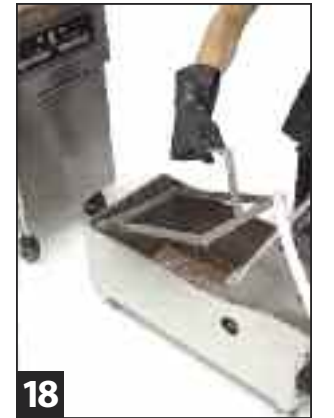
18 Remove and wipe off hold-down ring with paper towels.