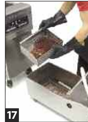
17 Remove, empty and wipe off crumb tray with paper towels. Discard crumbs into a fireproof container.