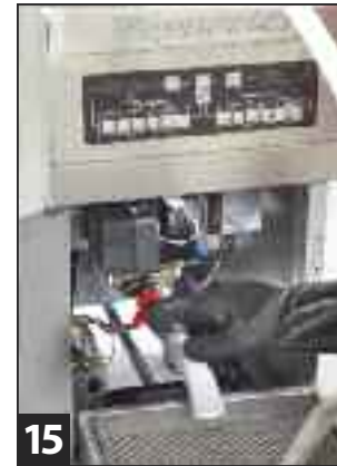
15 Close the drain valve (red handle). Hold the wand securely while turning on the filter pump. Return filtered oil to the frypot. Allow oil to bubble for 15-30 seconds to clear the wand hose of oil.