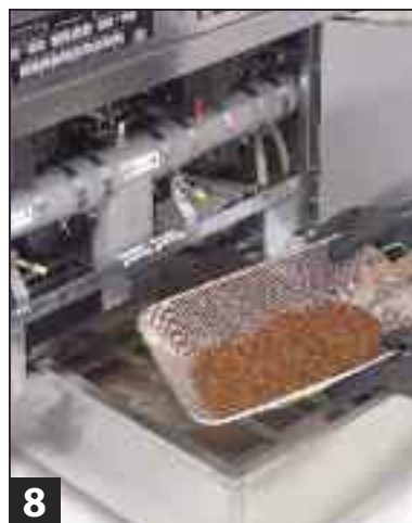
8 Turn off filter pump (yellow handle) and pull out filter pan. Remove, empty and wipe off crumb tray with paper towels. Discard crumbs into a fireproof container.