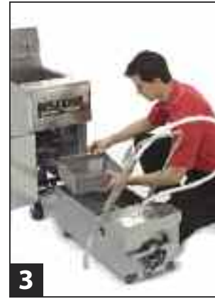
3 Remove optional crumb tray.