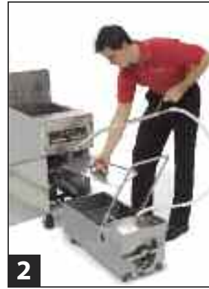
2 Retrieve stored portable filter and place near fryer. Remove filter pan lid. Make sure the filter pan is clean and prepared for filtering.