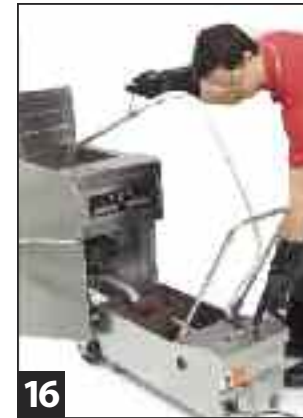
16 When all the oil is returned to the frypot, turn off the filter pump and unplug the filter power cord.