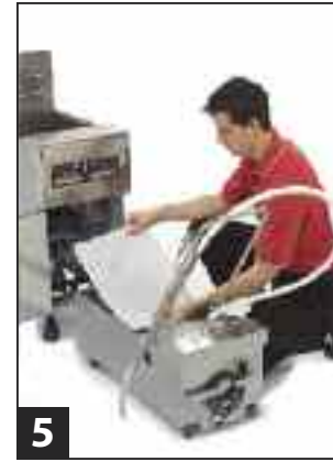
5 Install filter paper.