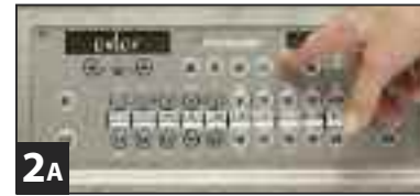
2A To count filters and utilize filtration prompts, press Filter button with controller on to start filtration.