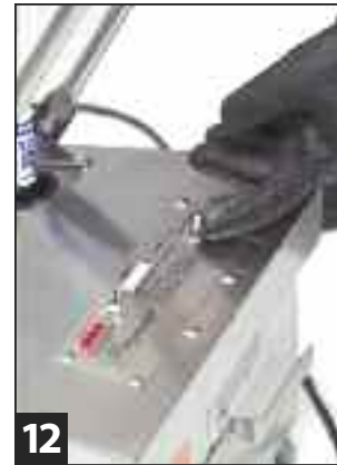
12 Hold the wand securely while turning on the filter pump. Allow the oil to circulate back to the frypot.