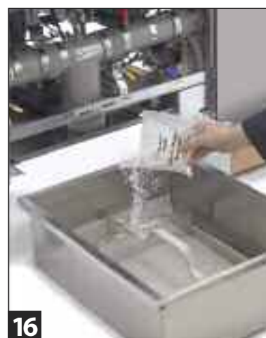
16 Sprinkle one filter powder packet (1 cup) over filter paper and return crumb tray.