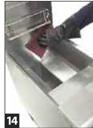
14 Use scouring pad if needed. Turn off filter pump. Then wipe out frypot with paper towels.