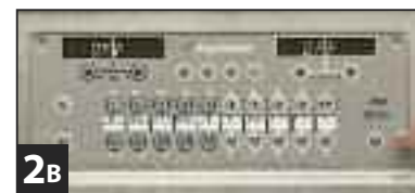
2B To bypass filter counts and filtration prompts, press OFF button to stop cooking cycle before starting filtration.