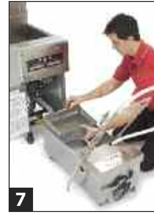
7 Replace optional crumb tray.