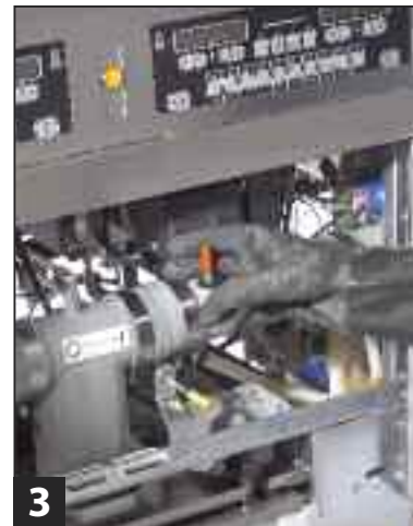
3 Make sure the filter pan is clean and prepared for filtering. Open the drain valve (red handle) and allow oil to drain into filter pan.