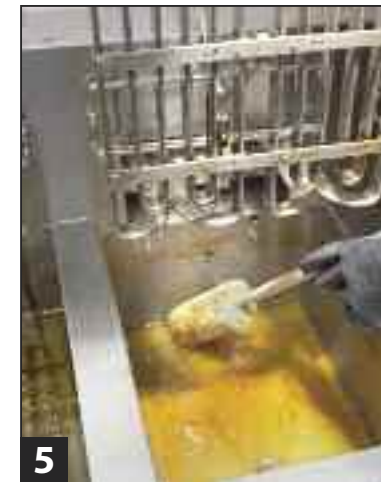
5 Brush crumbs from frypot with brush or scouring pad using circulating oil.