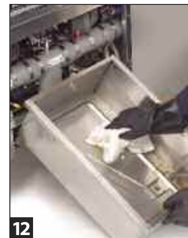
12 Wipe out filter pan with paper towels.

Wait until filter parts have cooled to the touch then return parts and prepare pan for filtration either now or just before the next filtration.