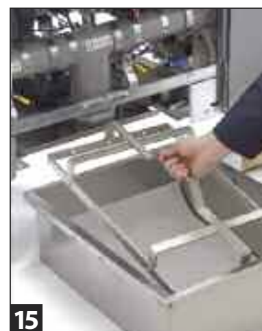
15 Make a good seal by placing hold-down ring over filter paper securing paper evenly and completely around all sides of the filter screen.