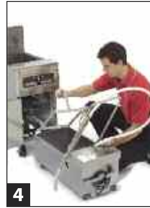
4 Remove hold down ring.