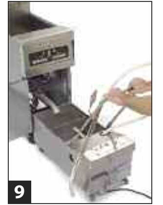
9 Position filter securely under the drain pipe.