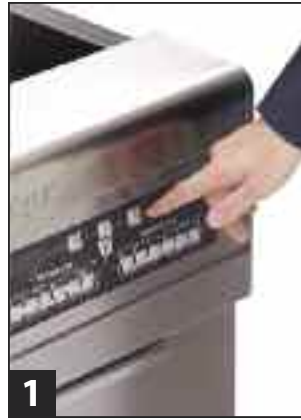
1 Press OFF button to stop cooking cycle. Filtration works best when done near cooking setpoint temperature.

Hot frying oil and equipment can cause severe burns. They must be handled with care to avoid such injury caused by improper handling techniques or inadequate protective gear. Be sure to wear all appropriate safety gear as directed in store operating manual when handling hot frying oil or equipment.