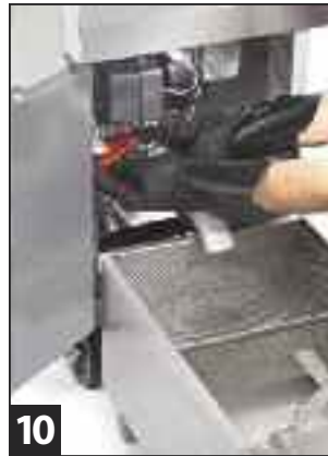
10 Open the drain valve (red handle) and allow oil to drain into the filter pan.