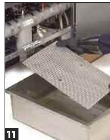
11 Remove and wipe off filter screen with paper towels.