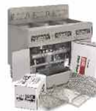
Built-in filtration accessories