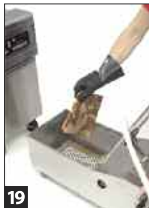
19 Discard filter paper.