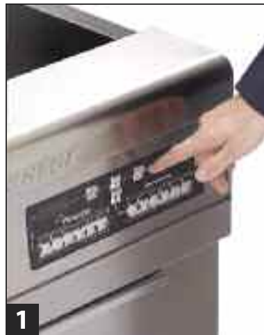
1 For all built-in fryers except fryers with the 3000 Controller, press OFF button to stop cooking cycle. Filtration works best when done near cooking setpoint temperature.

Hot frying oil and equipment can cause severe burns. They must be handled with care to avoid such injury caused by improper handling techniques or inadequate protective gear. Be sure to wear all appropriate safety gear as directed in store operating manual when handling hot frying oil or equipment.