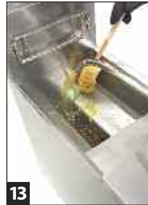
13 Use filter wand and fryer brush to remove crumbs from frypot sides and bottom.