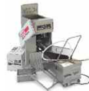
Portable filtration accessories