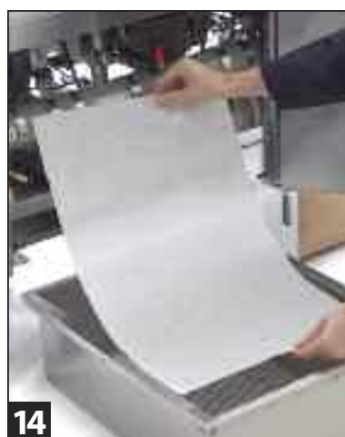
14 Install filter paper making sure it evenly laps all pan walls.