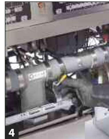
4 Turn on filter pump (yellow handle) allowing oil to circulate back to frypot.