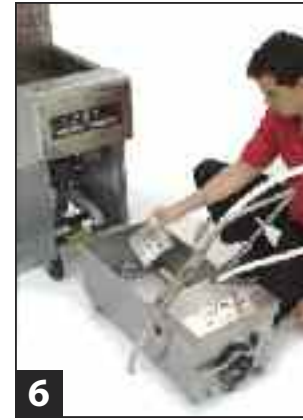
6 Replace hold down ring. Sprinkle one filter powder packet (1 cup) over filter paper.