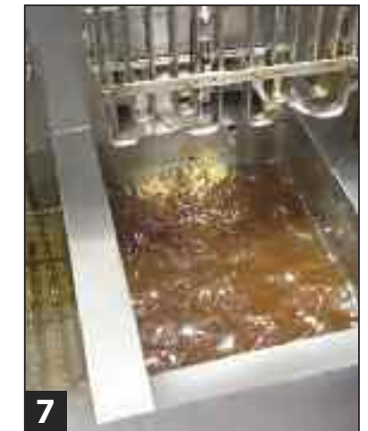
7 Close drain valve (red handle). Turn ON filter pump (yellow handle) and return filtered oil to the frypot. Allow oil to bubble for 15-30 seconds to clear return lines of oil.