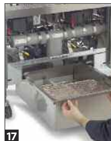
17 Slide filter pan back in place.