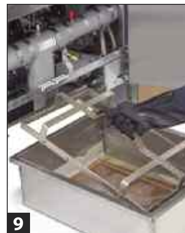
9 Remove and wipe off hold-down ring with paper towels.