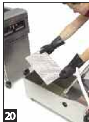
20 Remove and wipe off filter screen with paper towels.