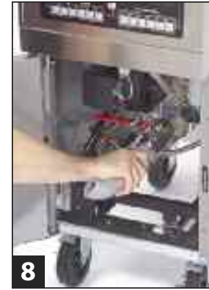
8 Plug filter power cord into electrical outlet. Attach drain pipe to fryer drain. Make sure drain pipe spout is pointed down.