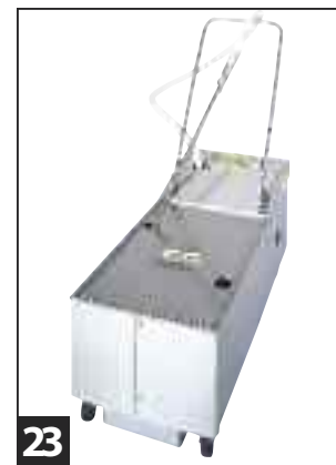
23 Return portable filter to storage area.