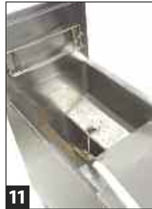
11 Place the filter's wand assembly securely in the frypot.