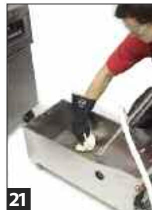
21 Wipe out filter pan with paper towels.