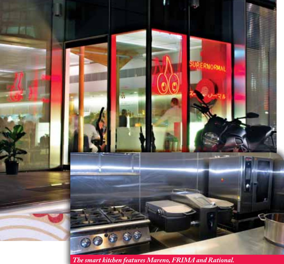
The smart kitchen features Mareno, FRIMA and Rational.

“It’s not about one piece of equipment, it’s the family of equipment and how it works together. The Mareno range complements each other aesthetically and functionally to create the seamless work flow we have to easily handle 500 covers.”