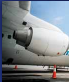
The fleet of specialised vehicles.