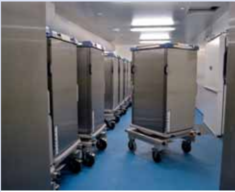
Ergoserv carts are loaded in the production kitchen.