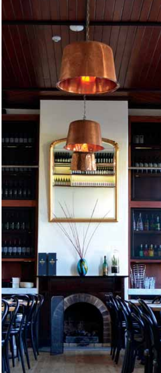
Old fireplaces and other historical pieces were incorporated into the formal dining room.