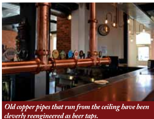
Old copper pipes that run from the ceiling have been cleverly reengineered as beer taps.