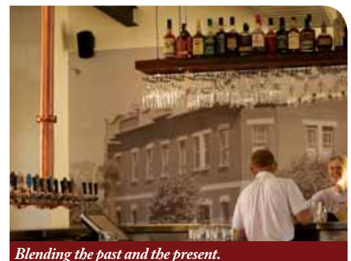
Blending the past and the present.