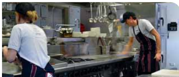
The heavy duty Garland range.

For example, we do a burger but we do it with house baked brioche and home-made patties."