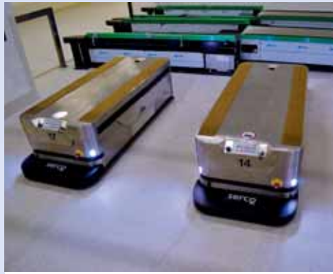
AGV units transport the carts remotely to the wards.