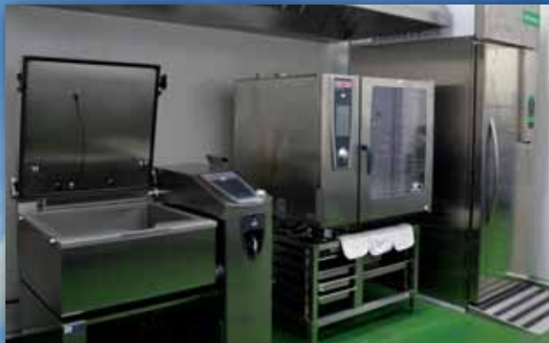
The Halal accredited smart kitchen and HACCP accredited and certified production facilities. The areas of green flooring signify Halal production areas.