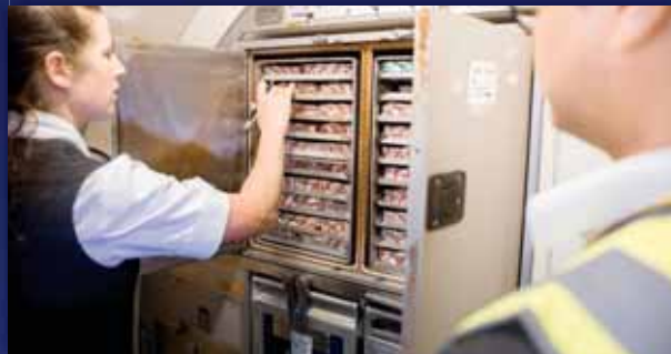
Trucks has direct tarmac access enabling prompt and efficient delivery to customers.

Perth Inflight Catering 1 Newton Road, Perth Domestic Airport Ph: (08) 9477 0777 www.inflightcatering.com.au In the Kitchen: Frima, Tecnomac, Rational and Cambro