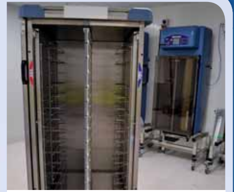
The Double Flow carts include hot and cold sections that are rethermalised via the Socamel docking stations (visible at rear).

Rethermalisation is when heat is put back into cooked food and reheated to temperature right before serving. It's not an additional cooking process.