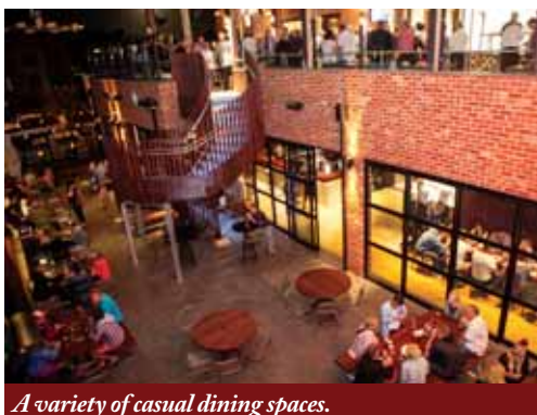
A variety of casual dining spaces.

"First and foremost, we're a pub but we want to be the best we can. Plus being the 'American' hotel we know customers have some expectations.