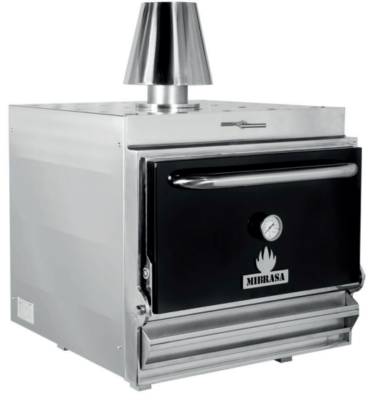
Shown with optional Firebreak