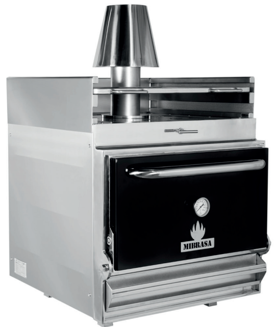
Shown with optional Firebreak