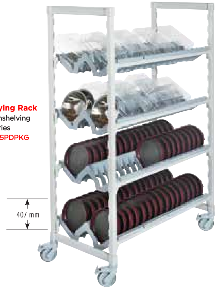
Angled Drying Rack Cambro Camshelving Premium Series CPMU244875PDPKG